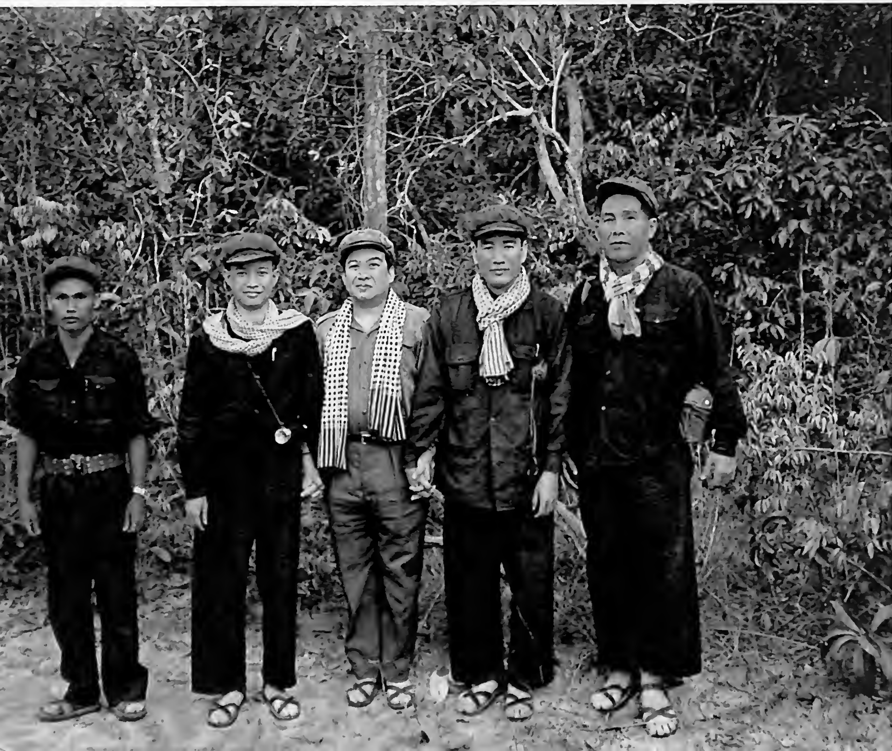
From second left: Mr. Khieu Samphan, Samdech Sihanouk, Mr. Hu Nim.